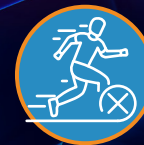
CAN'T KEEP UP WITH PEOPLE YOUR AGE

* It is important to note that symptoms alone aren't enough to diagnose EIB. An objective test performed by a specialist is required.